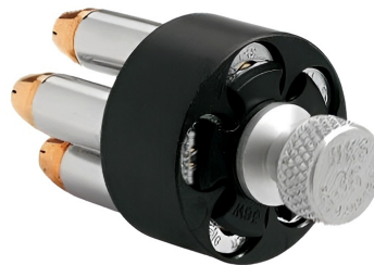
HK5 Speedloader Model 36-A

The Smith & Wesson Model 442 "Centennial" (c. 1990) is a variant of the original Centennial, the Model 40 (c. 1952), which are notable for their internal hammer.